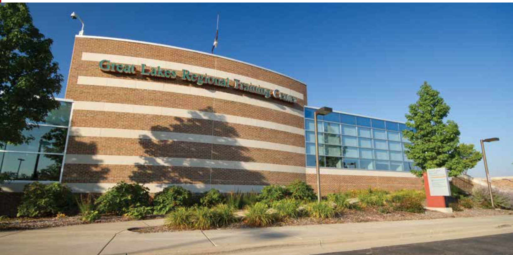
Great Lakes Regional Training Center at Washtenaw Community College