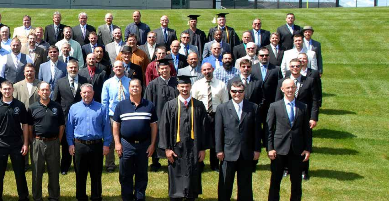
UA Instructors and Training Staff - 2014 UA Instructor Training Program.